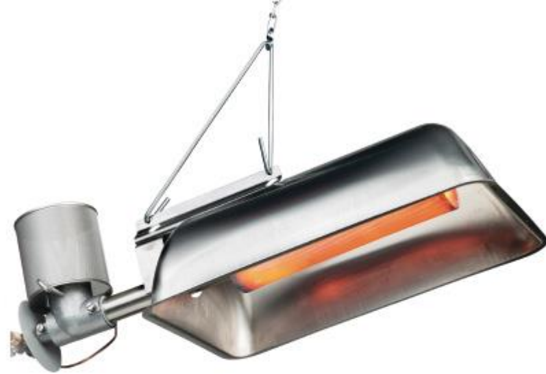
Gasolec M8 Heater

I don't want to heat the entire vertical space in the barn.